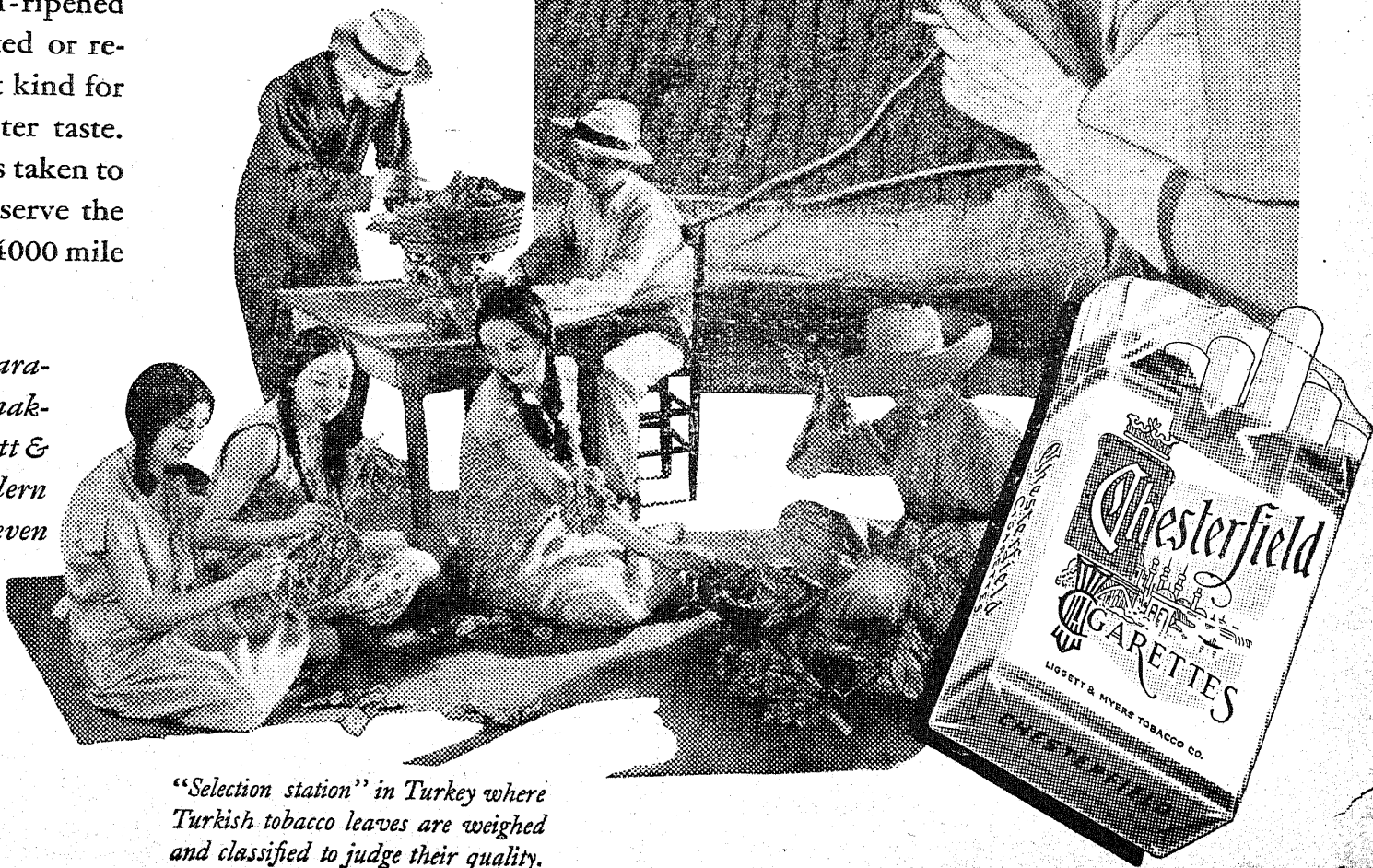
"Selection station" in Turkey where Turkish tobacco leaves are weighed and classified to judge their quality.

So important is the preparation of Turkish tobacco in making Chesterfields, that Liggett & Myers have their own modern leaf handling plants in seven important tobacco centers of Turkey and Greece.