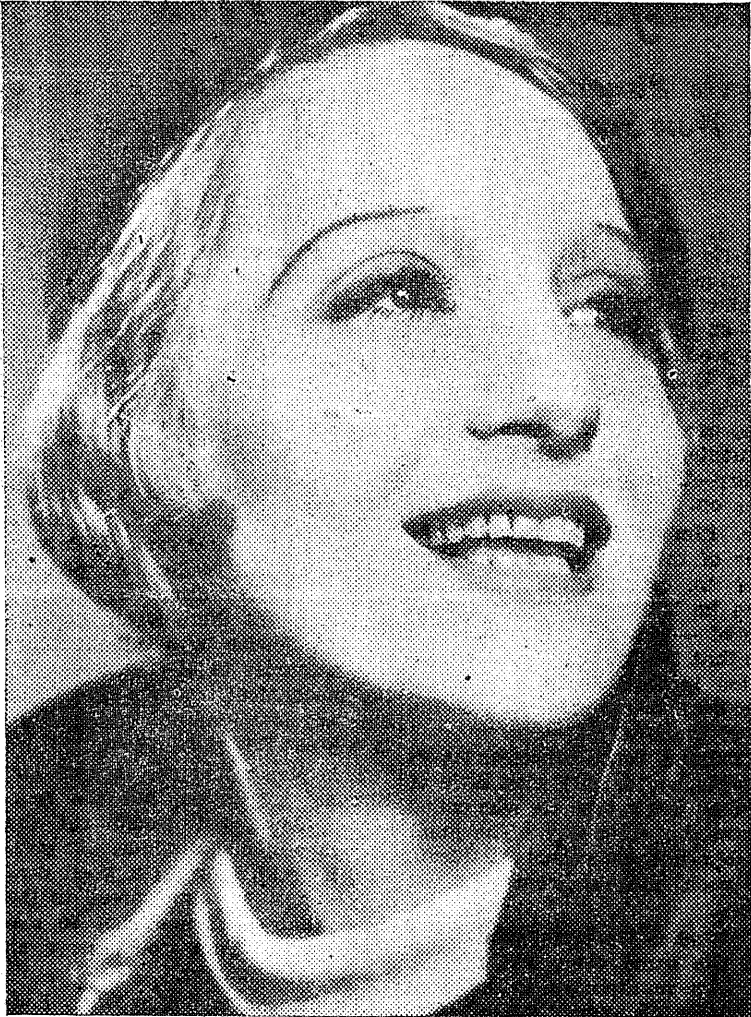
Elisabeth Bergner, brilliant Jewish actress whose performance in the stage play "Escape Me Never," was universally acclaimed, shows to even better advantage in the screen version of the play which is now running at the Music Hall.

Jewish actor, deserves great praise for his synchronization. He is the voice of Menachem Mendel in the synchronized version, and he makes a good job of it. His dialogue fits perfectly the action of the picture and adds humor to the entire film. It actually invests it with life.