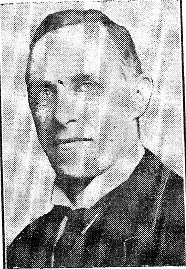
COL. JOSIAH WEDGWOOD