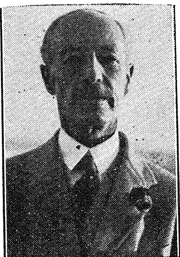
SIR ARTHUR WAUCHOPE