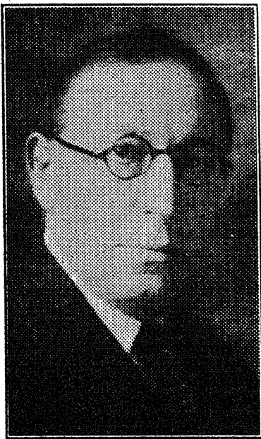
JUDGE JULIAN W. MACK

The month of May will be "Child Health Month" for thousands of American Jewish women who will mark the occasion by a series of events under the auspices of the 300 chapters of Hadassah, the Women's Zionist Organization of America.