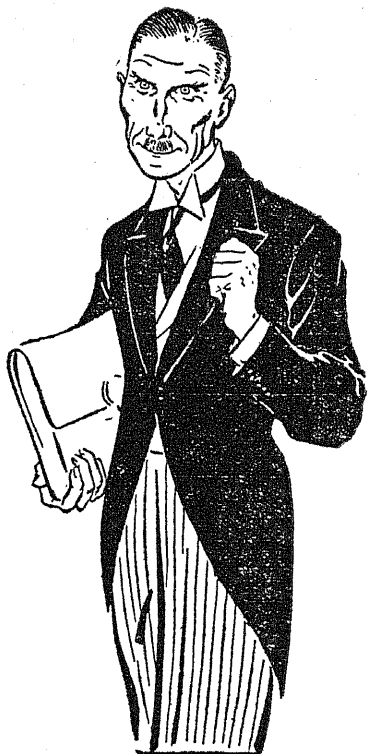
FRANZ VON PAPEN

It is not difficult to predict that the Berne trial against the Nazis for spreading the notorious "Protocols of the Elders of Zion," which will be resumed Monday, will conclude victoriously for the Jews. Forced to substantiate the anti-Jewish allegations which the "Protocols" contain, the Nazis are returning to the trial empty-handed.