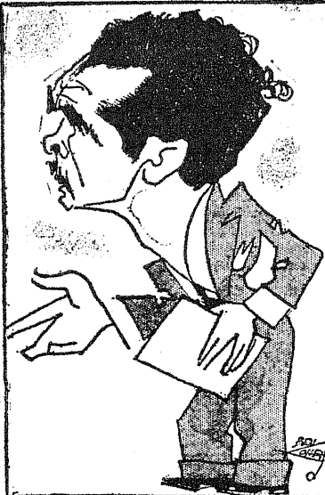
Sam Levene, well known American Jewish actor, who contributes largely to the hilarity of "Three Men on a Horse" at the Playhouse.