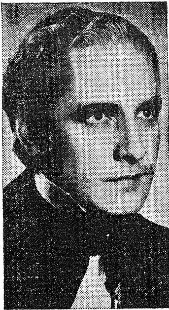
Frederic March as he appears in the role of Jean Valjean in the new film at the Rivoli, "Les Miserables."

actually gives him a ten per cent cut of the winnings, but fails completely to understand the nature of his new find. He believes he is a genius, what with his continual bursts of Mother's Day greetings and his unerring ability to pick horses, but being completely unacquainted with the species, he is at a loss with him.