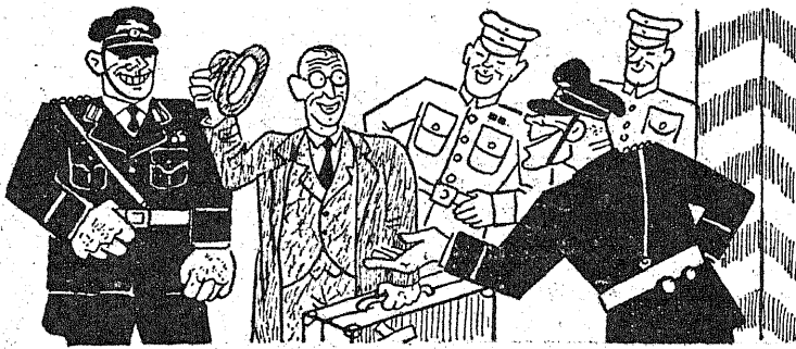
Welcomed at the German Border.