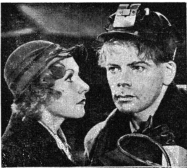
Paul Muni and Karen Morley in a tense moment during the new film "Black Fury," now being shown at the Strand and the Brooklyn Paramount.