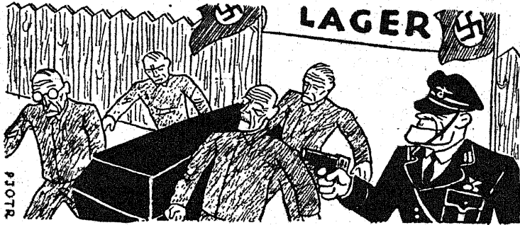
Being Graduated from the "Educational Course."