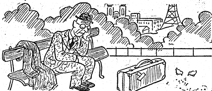
Saying Good-bye to Paris.