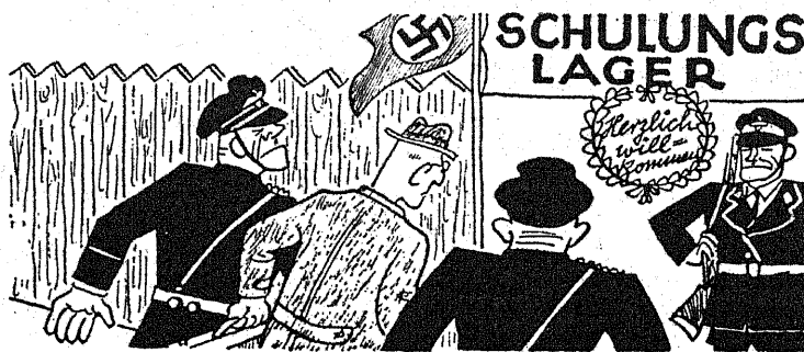
Escorted to a Nazi "Educational Camp."