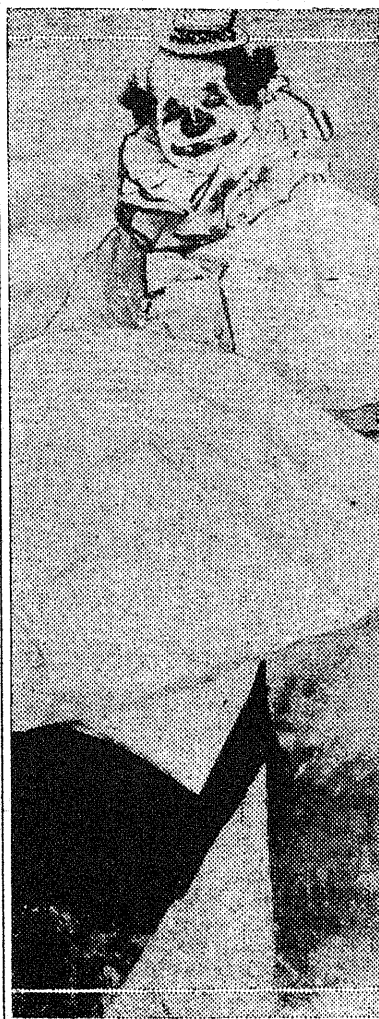
Felix Adler, a famous Jewish clown, who is among the large troupe cavorting in the sawdust of the Garden.

NARROWSBURG, NEW YORK 100 miles from New York City FOR GIRLS — FOR BOYS Located in the Shawang Mountains— 1400 ft. altitude — "Camp Utopia for Girls" and "Camp Utopia for Boys" nestle close to a private lake, in the heart of our large estate. The brother and sister camps are secluded from each other and are conducted as two separate units. Parents accommodated. Jewish dietary laws and Sabbath spirit observed. For booklet apply to LAURA J. LIEBOW — ISIDOR LIEBOW Phone SLocum 5-5468 1219 Union Street Brooklyn, N. Y.