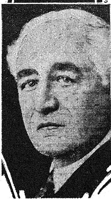
ADOLPH S. OCHS