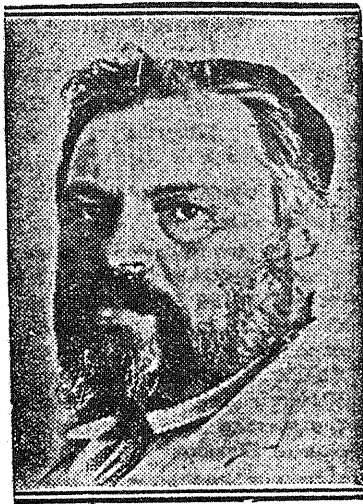
RABBI MEIER BERLIN

Rabbi Berlin warned against a split in the Zionist ranks. "Woe, if the days of the last Zionist