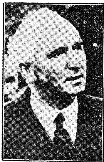
SIR JOHN SIMON