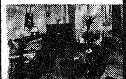
Well-proportioned living rooms permit artistic arrangement of furniture.