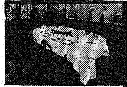
Private dining rooms for smart functions are available at each hotel.

Dignity and charm distinguish Blue Ribbon reception rooms.