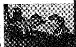
The spacious chamber is an attractive feature of your Blue Ribbon home.