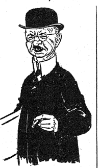
DR. HJALMAR SCHACHT

The need to consider Biro-Bidjan as a Jewish colony is also being considered by the Soviet government. The need to consider Biro-Bidjan as a Jewish colony is also being considered by the Soviet government.