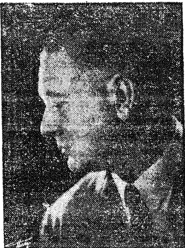
George Baklanoff, who sings the title role in 'Boris Godounoff,' to be presented tomorrow night at Mecca Temple.

fying statements for foreign consumption while relentlessly pursuing oppression against liberals, labor, Catholics, Jews and all who cannot be imprisoned within Gleichschaltung."