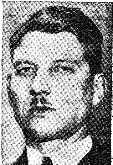
DR. KURT SCHUSCHNIGG