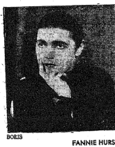
BORIS FANNIE HURST

All her life, Ervine Tate had borne her family's burdens. She had taken care of her helpless parents, supported her brothers and sisters, freed the farm from debt. Now, her responsibilities ended, she was desperately sick herself—sick with the realization that, at 32, life offered nothing but a lonely spinsterhood, a "deadly empty vacant this."