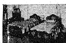
The spacious chamber is an attractive feature of your Blue Ribbon home.