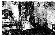
This restful boudoir will appeal to those seeking a real home.