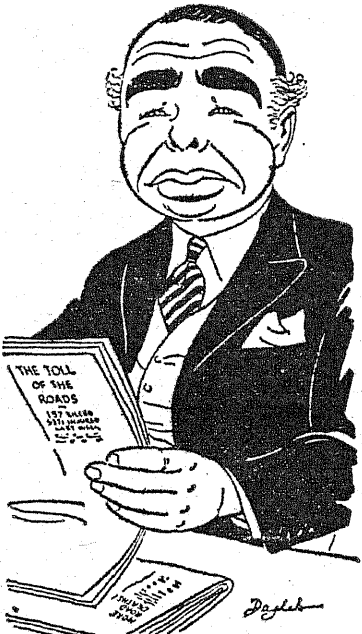
In London Limelight LESLIE HORE-BELISHA

Louis Golding, the novelist whose "Magnolia Street" and other works made him as popular