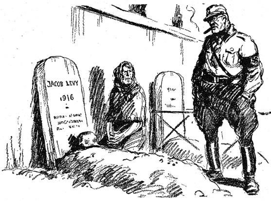
NEWS ITEM: An official investigation by the German government into the claims made by the Reich League of Jewish Front Soldiers that 12,000 Jews were killed while fighting for Germany has resulted in vindication for the League's statistics. The investigation was demanded by the League itself when the figures contained in its memorial book of the war were contested.