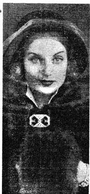
Carole Lombard as Mary in "The Gay Bride" at Rialto.

a matter of course. However, in the case of "The Mighty Barnum," United Artists is to be congratulated. I do not remember seeing a more dignified and sustained campaign than was prepared for this film, and incidentally, it deserves it. . . .