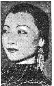
Anna May Wong as Tu Tuan in "Limehouse Blues" at Rialto.