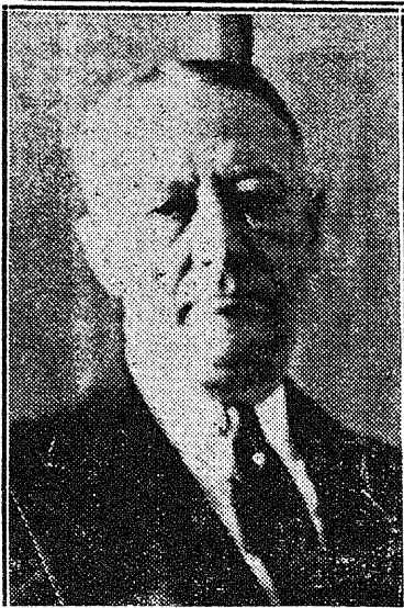
ALFRED E. SMITH