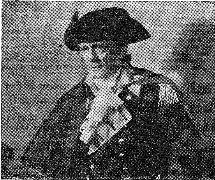
Philip Merivale, as George Washington, in "Valley Forge," the Theatre Guild's new production which opens Monday at the Guild Theatre.

This week will also see the end of the D'Oyly Carte Opera Company four-week repertory, which stretched out into fifteen weeks.