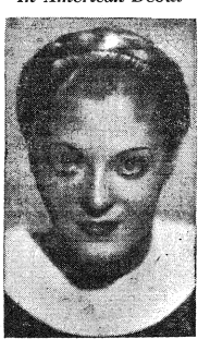
Ketti Gallian, one of those pretty French girls, who has the role of Marie in "Marie Galante," melodramatic film currently at the Mayfair.

voice as Grace Moore and the entire picture is an enjoyable, pleasing-to-the-ear production.