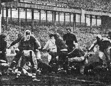
Ken Strong of the Giants (number 50) making a touchdown in the second period of game at Polo Grounds against Chicago Bears. Harry Newman (crouching figure near goal post), the brilliant Jewish quarterback, was hurt in the next period. An examination revealed two fractured vertebrae. Harry is out for the rest of this season.

After a very successful season with the French outfit Newman made the varsity in his sophomore