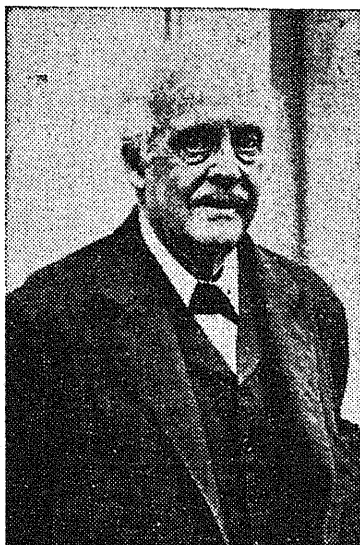
THE LATE LORD BALFOUR A photograph taken on his eightieth birthday.

Premier Lloyd George turned to Dr. Chaim Weizmann and said: "We have given you a