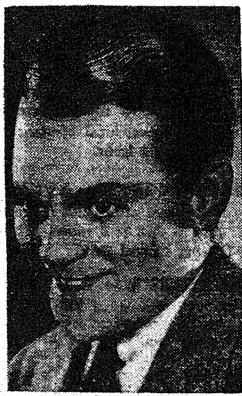
Jimmy Cagney, appearing in the new film at the Strand.