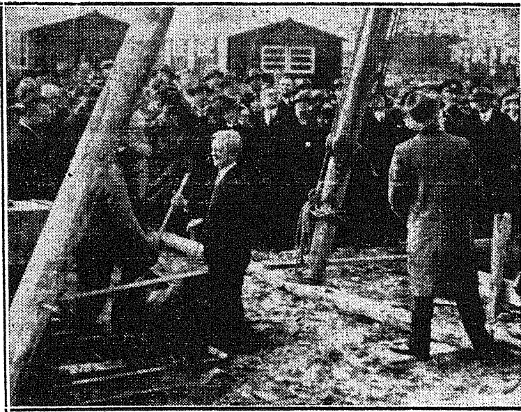
Here is James G. McDonald, League of Nations High Commissioner, driving the first pile as the work of developing the "Werkdorp Nieuwsluis" colony for exiles from Hitlerite Germany began. The colony is situated on land reclaimed from the Zuyder Zee.