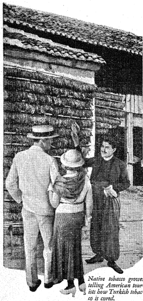
Native tobacco grows telling American tourists how Turkish tobacco is cured.

It is by blending and cross-blending these different tobaccos that we make Chesterfield the cigarette that's milder, the cigarette that tastes better.