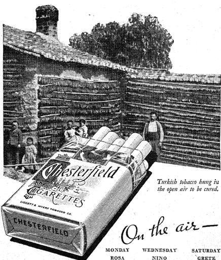
Turkish tobacco hung in the open air to be cured.