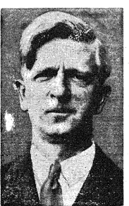
JAMES G. McDONALD

This state of affairs, with the burden of supporting Mr. McDonald's office falling upon Jewish organizations solely, has recently provoked much comment in the Jewish press. It has been pointed out that the League has taken more concrete interest in settling the Assyrians from Iraq than in helping the