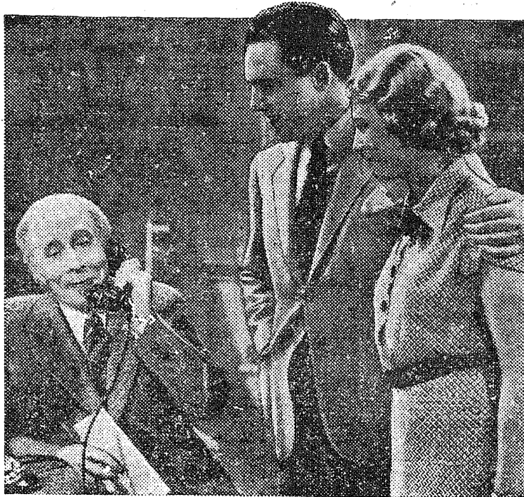
George Arliss, Charlotte Henry and Frank Albertson in a scene from "The Last Gentleman," opening today.