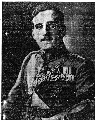
Portrait study of King Alexander I of Yugo-Slavia, who was killed by assassins' bullets Tuesday in Marseilles.