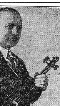
Ruth Gordon, doing fine work in "Sleeping Clergymen." At left, Michela Elman, the renowned violinist, who recently returned from South America.

my best friends are Jews," that these persons who utter it don't understand themselves.