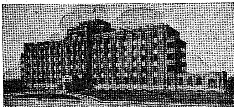
This is a view of the Jewish General Hospital, officially dedicated in the Canadian city yesterday.