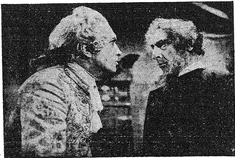
Conrad Veidt as Jew Süss and Cecil Hardwicke as Rabbi Gabriel in the film from the Feuchtwanger novel at Radio City Music Hall.

Christian principles of "love thy neighbor."