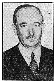
DR. EDUARD BENES