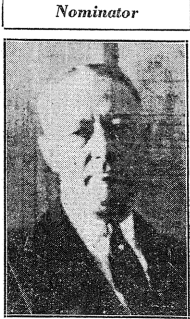
ALFRED E. SMITH

Among the chief demands made by the union are a ten per cent increase in wages, a reduction of working hours to thirty-six, a ten