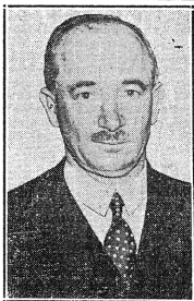
DR. EDUARD BENES

it is markedly noticeable in Central Europe, that even dictatorships have their obstacles, and that these obstacles are often greater than those which democracies meet. It is apparent now that no change in political nor in economic regimes is able to bring the longed-for wonders.