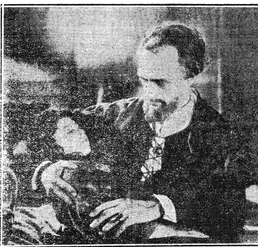
Conrad Veidt as he appears in Julius Hagen's film, which is scheduled to appear at the Capitol as soon as the present attraction ends its run.