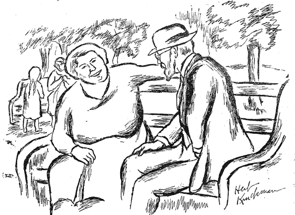
"And my granddaughter; only nine years old and such love letters she writes me."

beautiful orphan girl, but he will be content with the ugliest; a marriage to anyone would be preferable to his hateful solitude, the lack of a partner to share a yoke. And because these two unlike specimens of humanity, the doctor superior to his environment and the Talmud student inferior to it, share the same wish, a curious friendship develops, with each giving heart to the other, and to himself, by making much of little evidence that the epidemic is approaching. When Josel notes the absence from the synagogue service of an old worshipper, he seeks the reason, hoping for the worst.