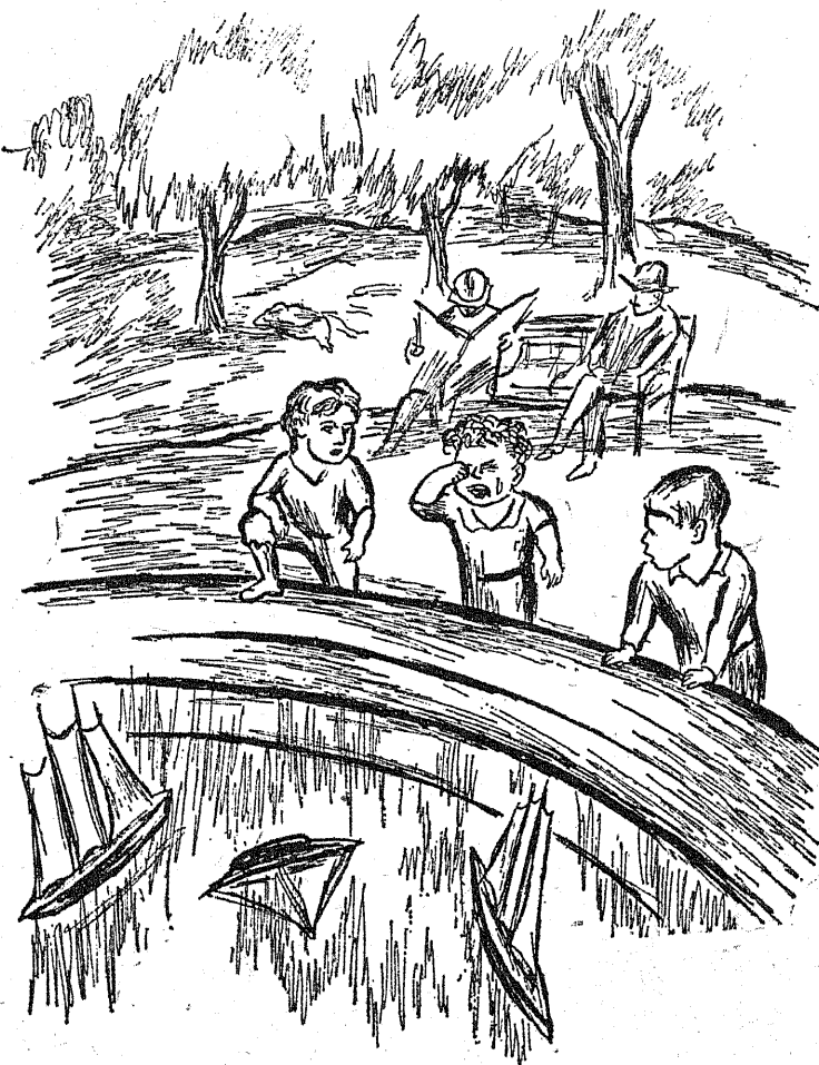
CASUALTY AT SEA

"Gosh, Jakie. You got to expect tougher sailin' here than in the puddles in Ludlow Street."