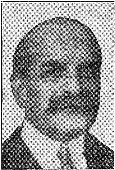
FELIX M. WARBURG