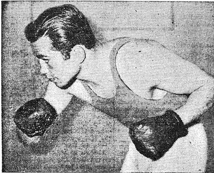
Barney Ross, holder of the junior lightweight, lightweight and welterweight crowns, has already started training for his second bout with Irish Jimmy McLarnin on September 6. Barney is not afraid of the "Bowl Jinx," nor of McLarnin's right.