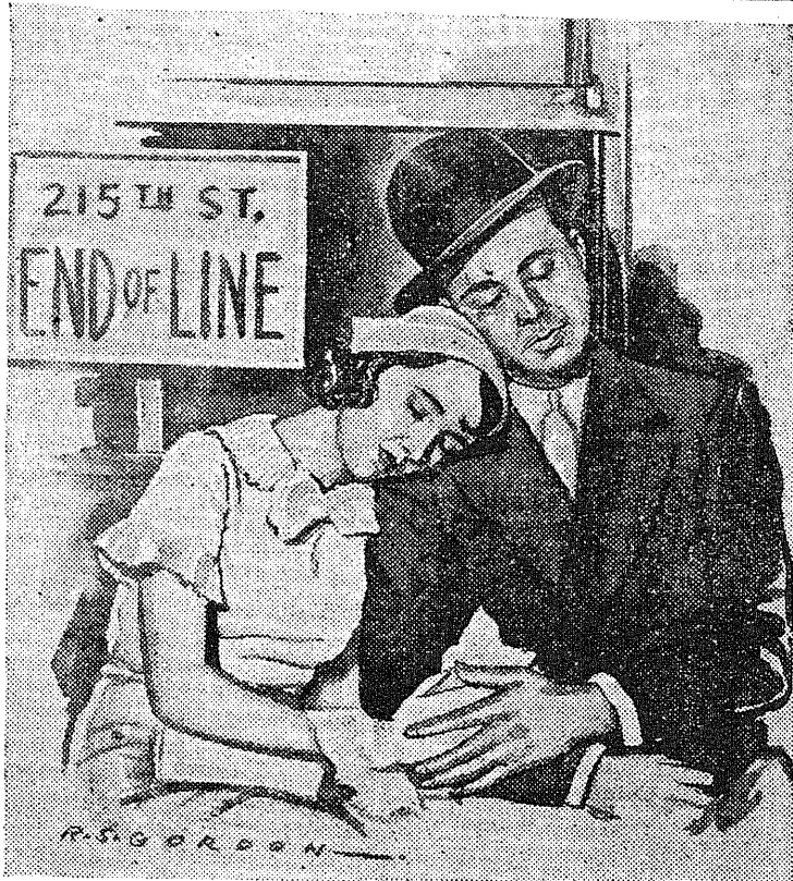
Ruby Keeler and Dick Powell as they appear in a scene in "Dames," film now showing on the Strand screen.