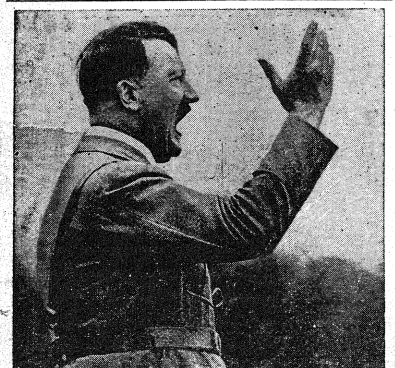
CHANCELLOR-PRESIDENT ADOLF HITLER