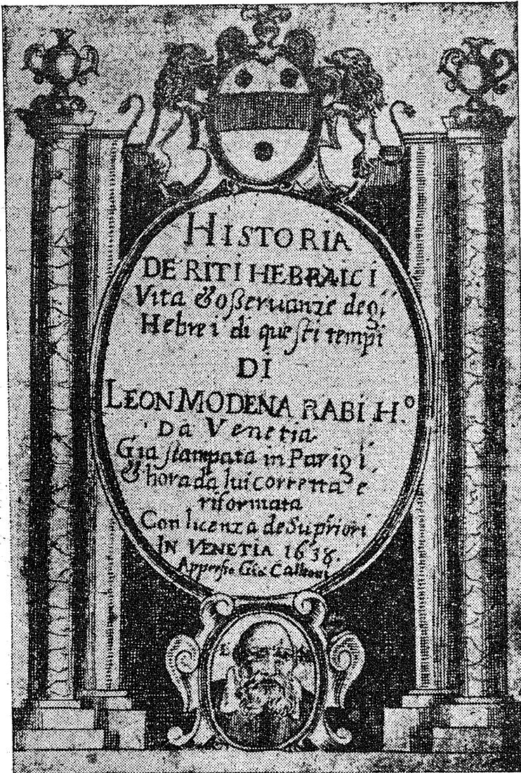
Title page of the "History of Jewish Ceremonies," written in 1638 by Rabbi Leon of Modena for James I of England, who also was responsible for the King James version of the Old and New Testaments.