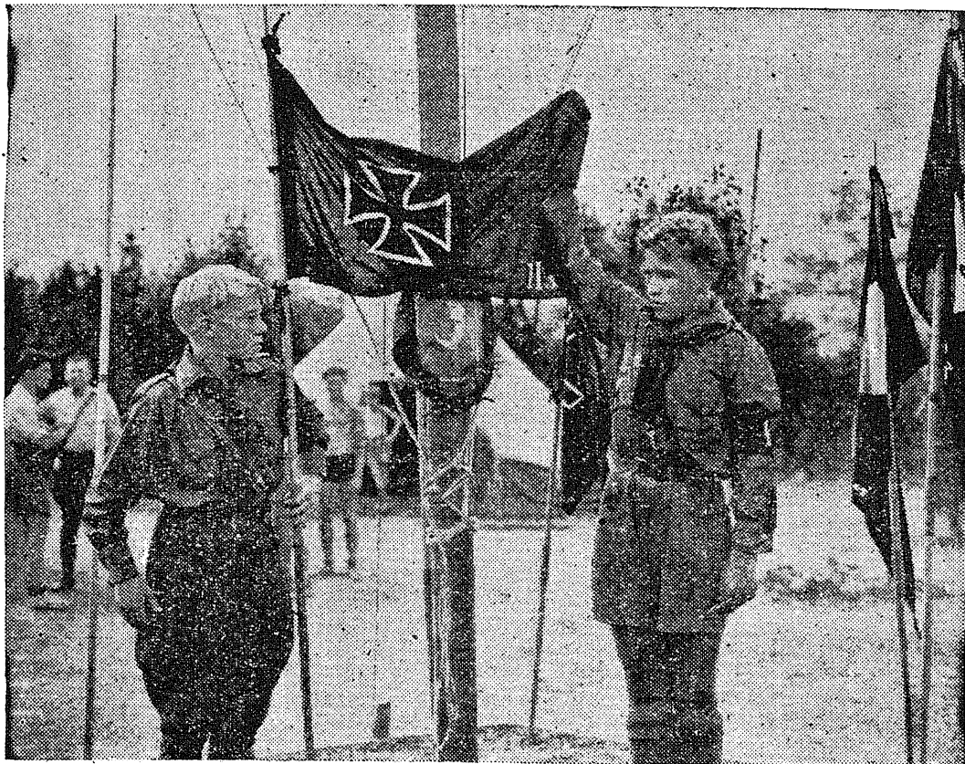
Young members of the German-American Boys League, who are being drilled in Storm Troop fashion at their camp in Griggstown, N. J., which is sponsored by the Friends of New Germany, drape one of their flags over a portrait of the late President von Hindenburg.