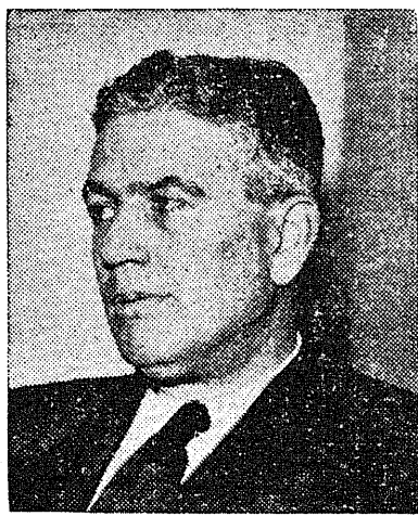
REXFORD G. TUGWELL