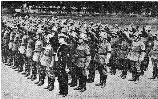
How the German army looked as it took the "Holy Oath" of allegiance to Adolf Hitler, Reichsfuehrer.