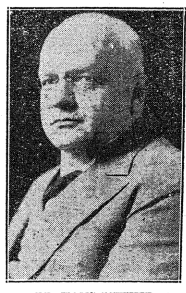
DR. HANS LUTHER