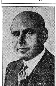
GOV. HERBERT H. LEHMAN