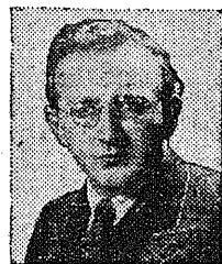
Fighter Against Hitlerism

Is coming to the United States in October for a two months lecture tour.