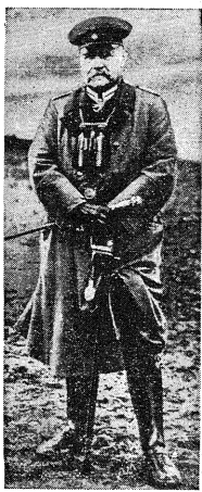
PAUL VON HINDENBURG