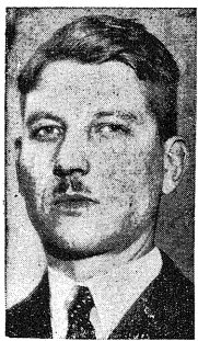
DR. KURT SCHUSCHNIGG