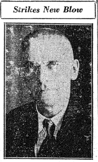
DR. WILHELM FRICK

Strikes New Blow Hitler Clashes With President On War Crosses