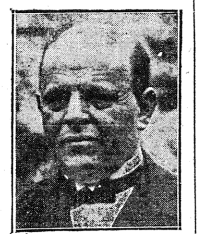
CHAIM NACHMAN BIALIK

three songs for her to learn. Those acquainted with her repertoire have heard them: A Lied Fun a Feigle; So Mir Du Shpin Melede; Lo Mir Sich Begeben.