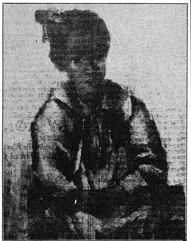
From the painting by Boris Deutsch.