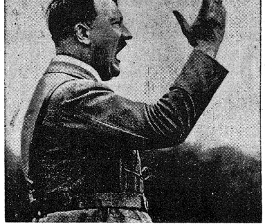
CHANCELLOR ADOLF HITLER