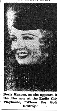
Doris Kenyon, as she appears in the film now at the Radio City Playhouse, "Whom the Gods Destroy."