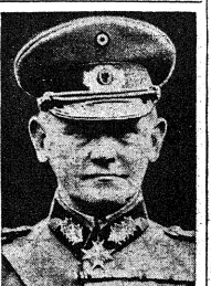
GENERAL VON BLOMBERG