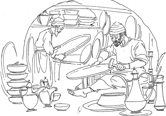
From the etching in line by Lionel Reiss.