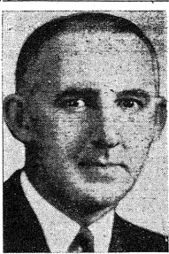
PROF. RAYMOND MOLEY