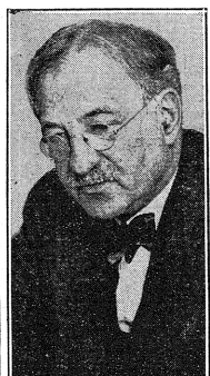
SALMON O. LEVINSON

Keep up with Jewish news by reading the Jewish Daily Bulletin, only English language Jewish daily news.