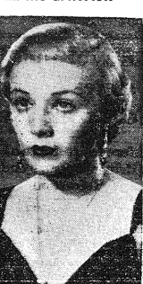
Madeline Carroll, appearing in the film, "The World Moves On."