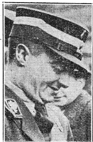
KARL ERNST, Executed Storm Trooper