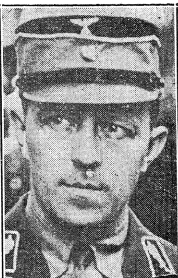
COUNT W. H. HELLDORF, Reported Shot and Killed