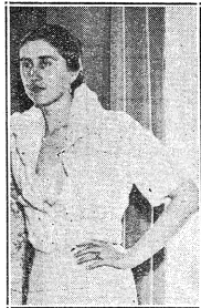
FRAU VON SCHLEICHER, Joins Husband in Death