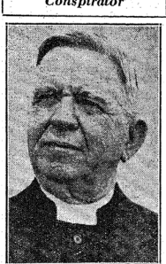
S. PARKES CADMAN