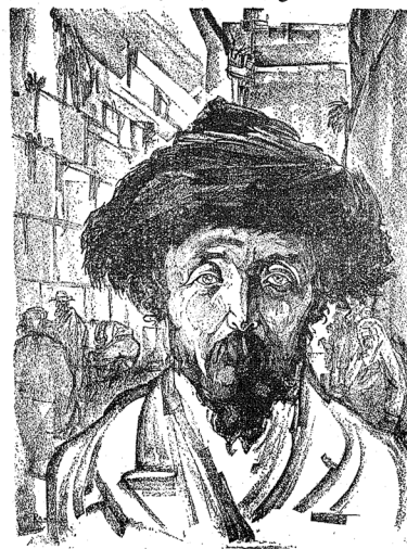
An Ashkenazi Jew