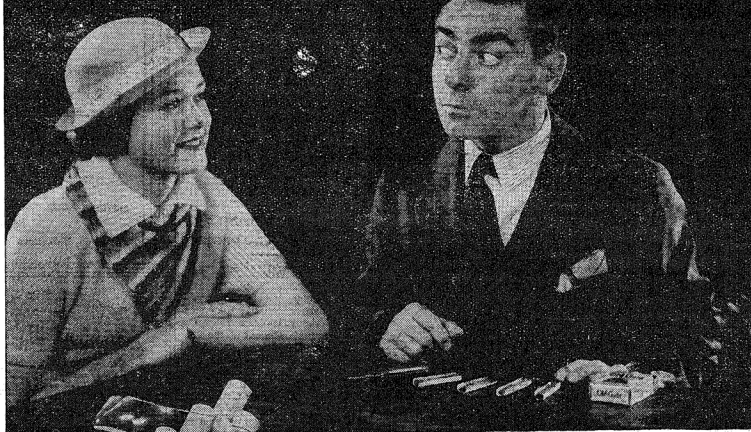
EDDIE CANTOR... America's premier comedian. Star of the radio and screen.

"WHATCHA doin', Eddie?" asked the girl who's always curious. "Judging a tobacco Beauty Contest?"