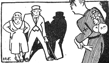
Germany, declaring a moratorium, keeps the other hand out of right.