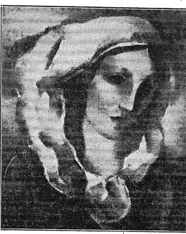
From the painting by Boris Deutsch, in the collection of the San Diego Museum.