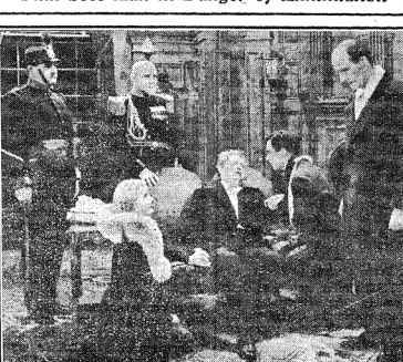
Scene from "Are We Civilized?" social problem picture which opens at the Rivoli Theatre today.