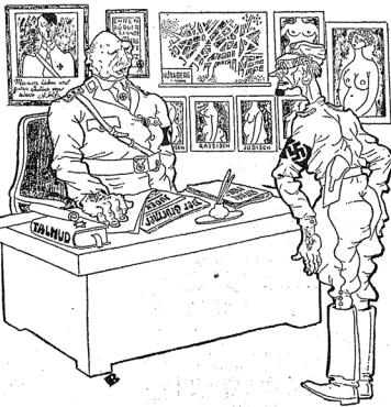
"Please see to it that in our next issue of Der Stuermer we have thirty-four more Jewish crimes and new plots and two more pages of advertising."

The free margin has been reduced from 200,000 marks to 50,000 marks, the paper says, and those who on January 1, 1928, or January 1, 1931, possessed real estate property exceeding 50,000 marks will become liable to payment of flight tax.